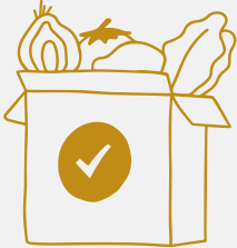
FOOD SAFETY CERTIFICATION P. 60